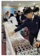
A high school group of 50 students visited the YTC Green Café.