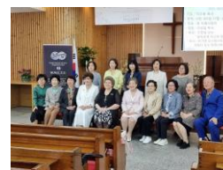
The Officers and Trustees of KWCTU