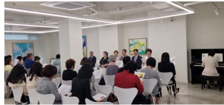
At the dedication of the gallery ceremony, all the people sang "This is My Father's World", praising our Lord who created the heavens and earth for us to see His glory and His magnificence.