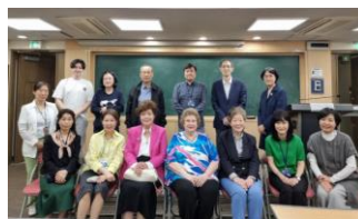
YTC members and those who attended the lecture.